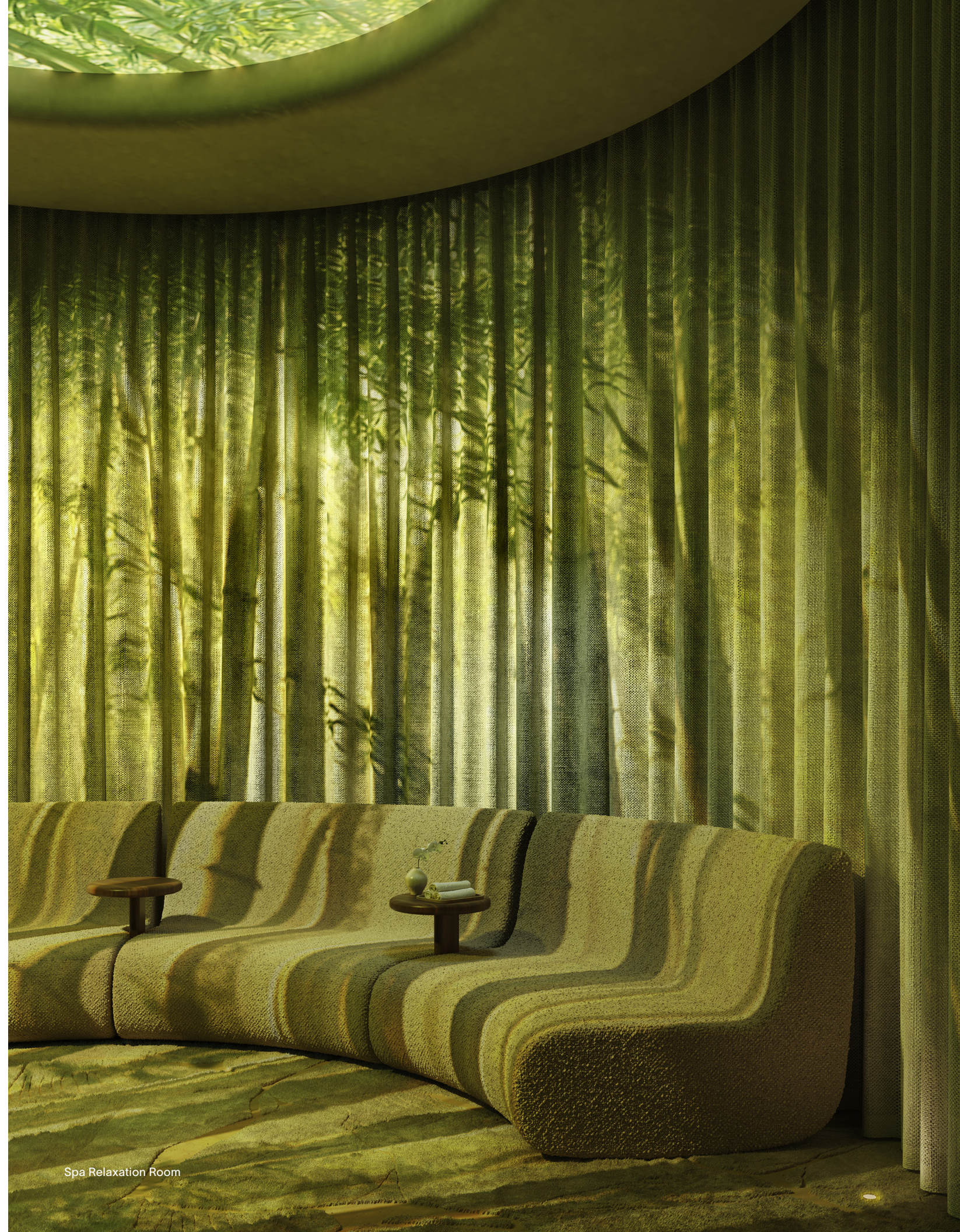
Spa Relaxation Room